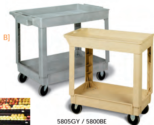
5805GY / 5800BE